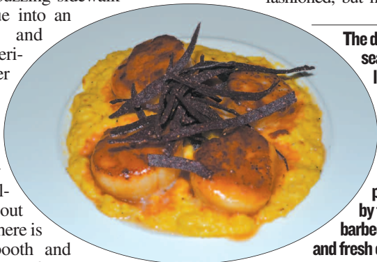
The delicious seared sea scallops have a unique and distinct sweetly caramelized flavor, complimented well by the chipotle barbecue sauce and fresh corn.

“I’d call it a fall version of the Arnold old fashioned, but not as strong,”