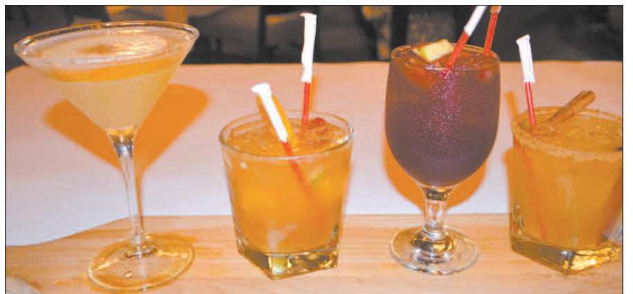
This cocktail paddle boasts four Honu signature cocktails. Pictured is the Absolut Pear Martini, the Harvest Moon Old Fashioned, seasonal sangria, and Pumpkin Cider, made with in-house pumpkin-infused vodka.