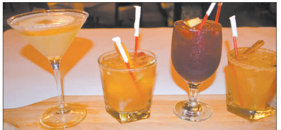
This cocktail paddle boasts four Honu signature cocktails. Pictured is the Absolut Pear Martini, the Harvest Moon Old Fashioned, seasonal sangria, and Pumpkin Cider, made with in-house pumpkin-infused vodka.