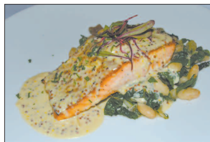
The seared salmon entrée, smothered in a grain mustard cream sauced and served with sautéed Swiss chard and navy beans, is wholesome and well seasoned.

The seasonal autumn menu kicked off at the end of September, and is available until Thanksgiving.