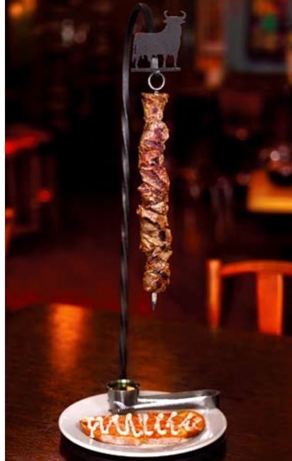
This beef tenderloin toro brocheta is a presentation piece at Chicago's Cafe Ba Ba Reeba!

So, piquillo peppers—Spanish to the core—are given an American twist with a stuffing of braised short ribs. Carrot, onion and celery are browned, then garlic and tomato paste are added. Red wine deglazes the pan, and the liquid is then reduced. The braised short ribs are added back in, along with fresh thyme. The ingredients